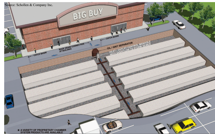
INFILTRATION CHAMBER SYSTEM UNDER A PARKING LOT